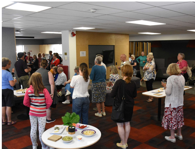
First timer's welcome

It is wonderful to have so many first people attending their first summer school, and fabulous to meet and greet at yesterday's welcome.