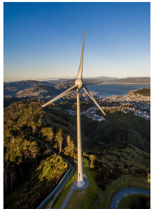
Brooklyn Wind Turbine

Did you know New Zealand's first commercially viable wind turbine was built in Wellington?