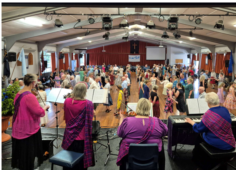
Youth night with Wild Heather.